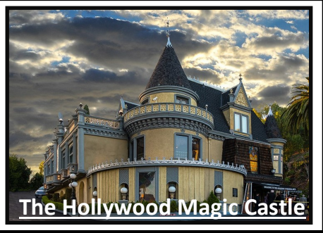
The Hollywood Magic Castle